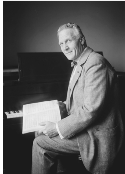
Fyodor Chaliapin (1873 - 1938)