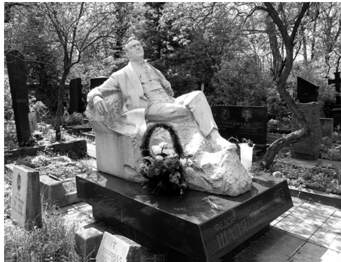
Chaliapin's Grave Novodevichy Cemetery, Moscow