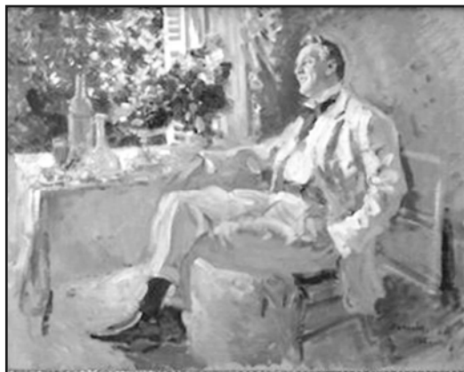
Fyodor Chaliapin, 1911